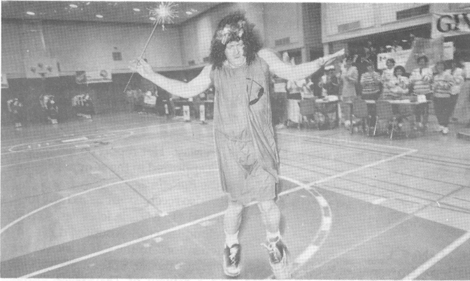
Teams of federal departments were in fine form at the Bureaucratic Olympics on Sept. 25 in Riddell Hall gym. Crosbie's Crushers (Transport Canada) won the gold medal, Housing Hosers (Canada Mortgage and Housing) took the silver, and Tax Breakers (Taxation Centre) captured the bronze. The competition, sponsored by the CBC, was held to raise awareness of the United Way's 1987 campaign.