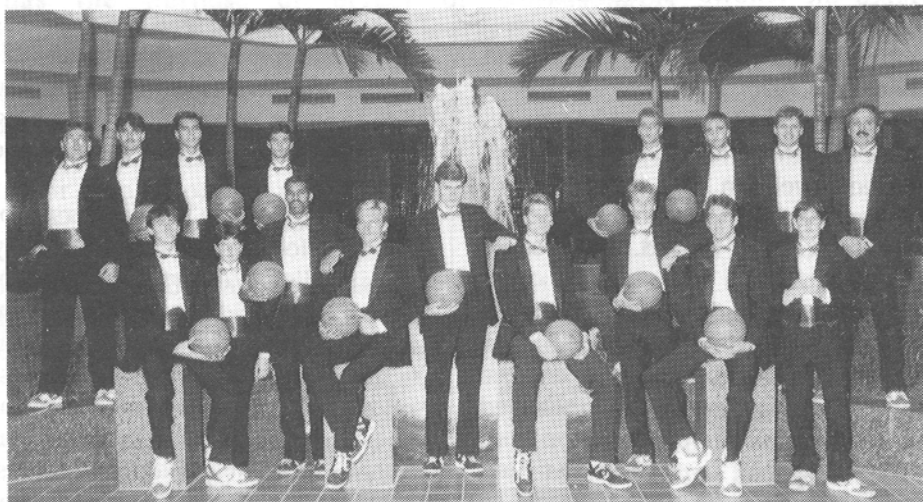
The University of Winnipeg Wesmen Basketball Team - The Class of '88

In 1973, the Alumni Association initiated the A.E.S. Program as a means to provide one $500 entrance scholarship from each of the graduating classes