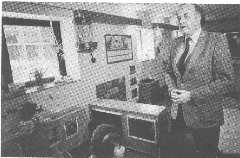
Premier Howard Pawley will be the guest speaker for the 1988 Bonnycastle Lecture on Feb. 18.

For more information, please call the Alumni Affairs Office at 786-9872 or 786-9122.