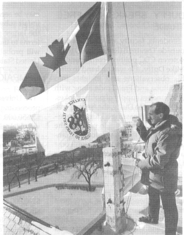
Hail to the new Centennial flag which commemorates the anniversaries of Wesley and United Colleges.

Carry me back to old United, That's where the students with the high brain power go; That's were the ladies are fair as the