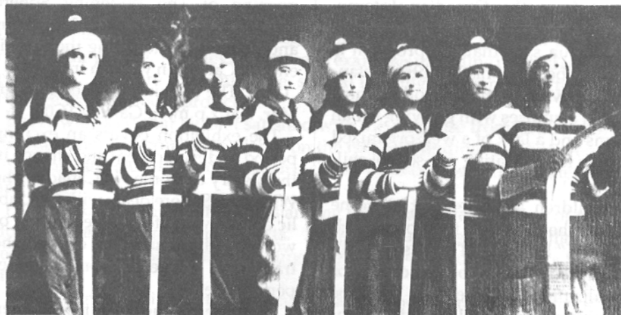
The exhibition The Widening Sphere: Women in Canada 1870-1940 will be on display from March 8 to April 8 in Gallery 1C03. See story inside.