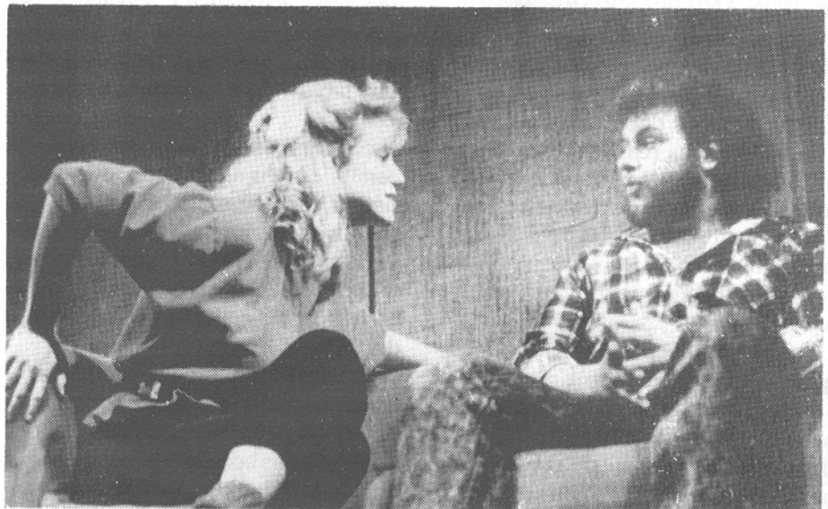
The play "Getting Somewhere," which was performed nightly from Mar. 25 - 31 in Convocation Hall, featured University of Winnipeg fourth-year acting students.

The institution of this system also makes us more equitable and comparable to the University of Manitoba, he added.