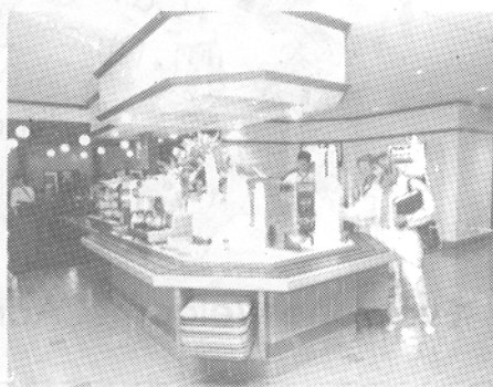
Left: A renovated Riddell Hall Cafeteria is open for business.