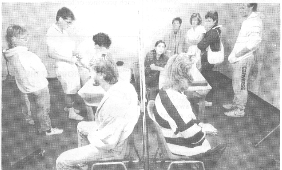
Above: Students getting their photos taken as part of the registration ritual.