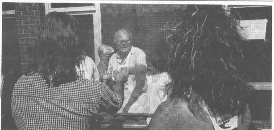
A BBQ in the Quad on Friday, September 15 was just one of the many activities during Student Orientation '89: Wake Up and Smell The 90's.