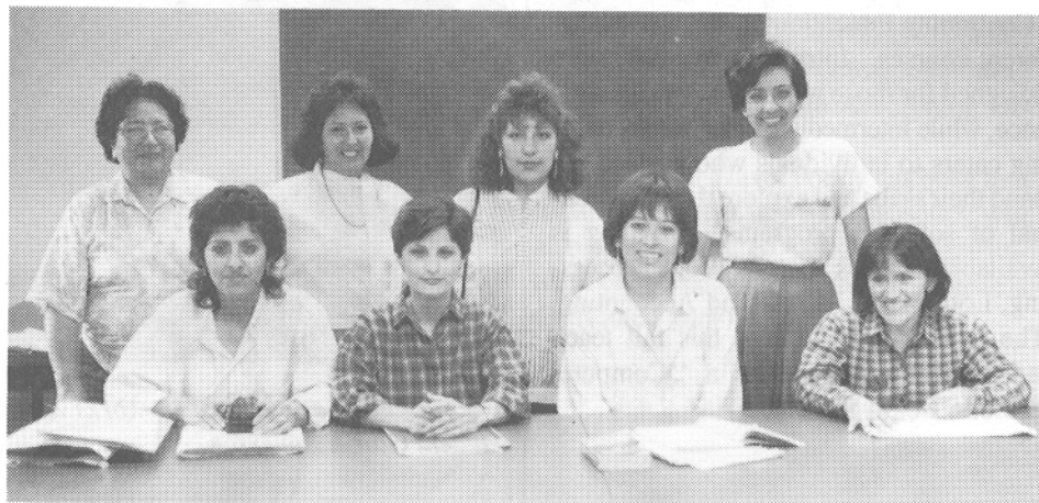
A team of eight child-care experts from Peru recently visited The University of Winnipeg.