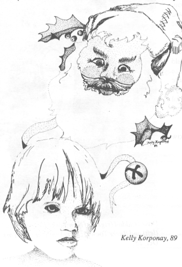
Kelly Korponay, 89

The next morning we awoke to the sound of tinkling bells in the living room. My brother and I were petrified - the all mighty, all knowing Santa Claus was in the next room!! It took a lot of courage to go in there and when we finally made it, the shock of seeing Santa and having every adult in the whole house laugh simultaneously, was too much for us. It sent us scurrying back into the kitchen, but Santa came over and dragged