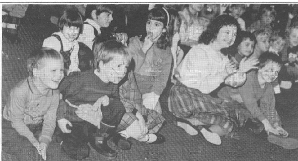
The annual University Children's Christmas Party was held on Sat., Dec. 9 in Riddell Hall Dining Room.