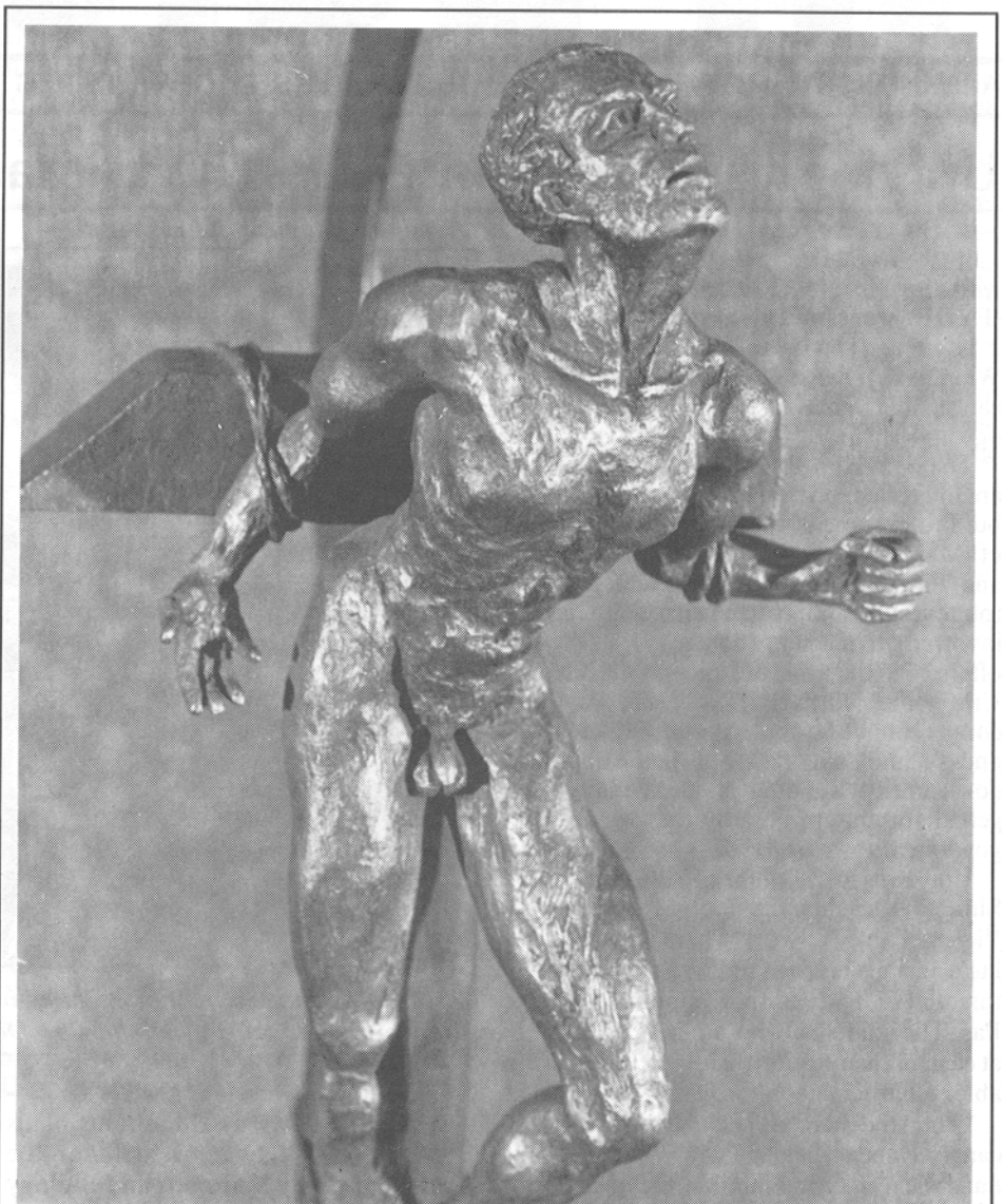
Crucified Again commemorates the victims of political oppression in Czechoslovakia.