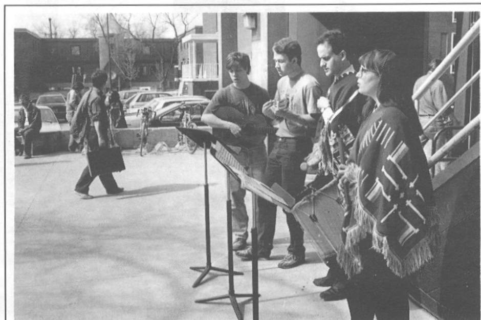
Warming up: The beautiful spring weather inspired the Macalester College Jazz Band to give an impromptu outdoor performance before their concert in Theatre 3C00.

According to Carter, the process is designed to take the issue out of the legal