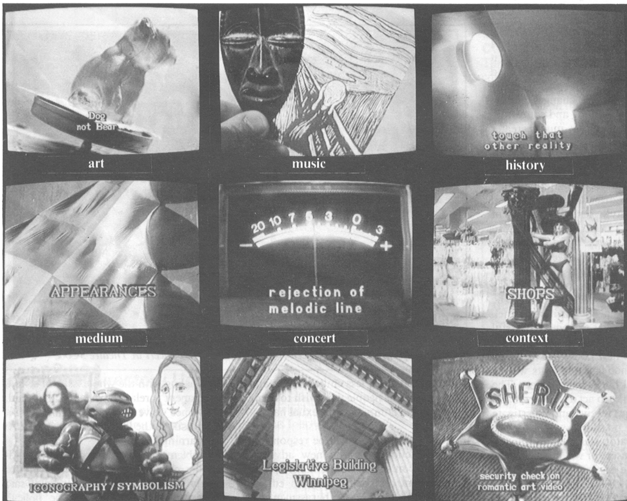
The interpretation of visual texts.

The videos produced for the FYDE program have also been shown to Majzels' students on campus. "Their response has been very positive," she said. "Videos supplement the course material in an interesting and challenging way for students both on and off campus."