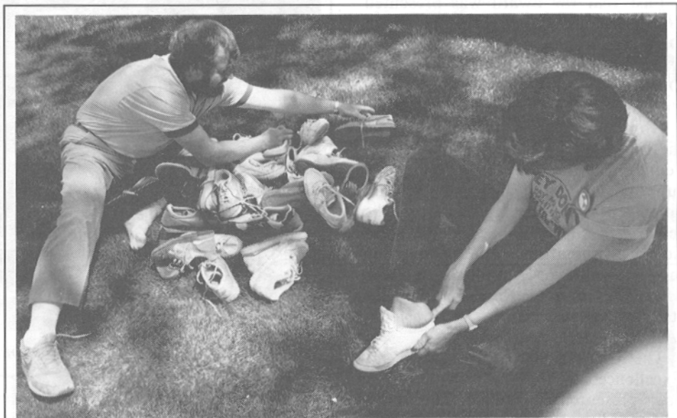
It's sneaking up on us: National Sneaker Day is May 24 this year, so get ready to lace up your running shoes and participate in some of our Canada Fitweek activities. See "Coming Events" for details.

Winners are chosen by a committee representing administration, faculty, alumni and students. The committee considers whether the nominee establishes a good rapport with students, encourages