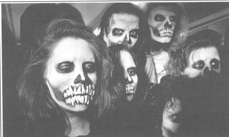
The ghouls of Bryce Hall: Theatre students in a make-up class on Hallowe'en.