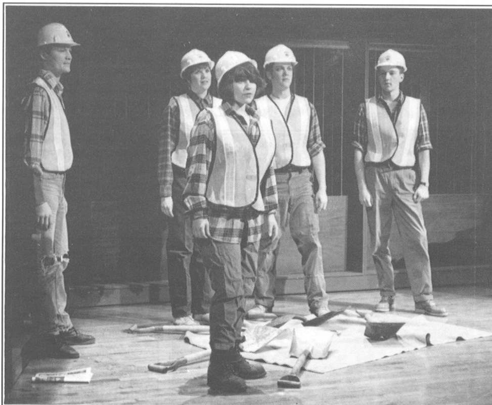
Comedy-opera was on the program at the Eckhardt-Gramatté Hall opening. Middle Distance Productions performed "City Workers in Love."