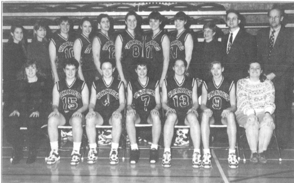
The Wesmen women's basketball team won their 70th consecutive game, breaking the North American record of 69 straight wins.