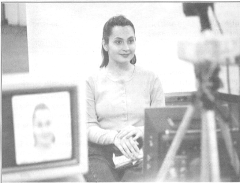
Smiling for your student card is one of the rituals of fall registration at The University of Winnipeg.