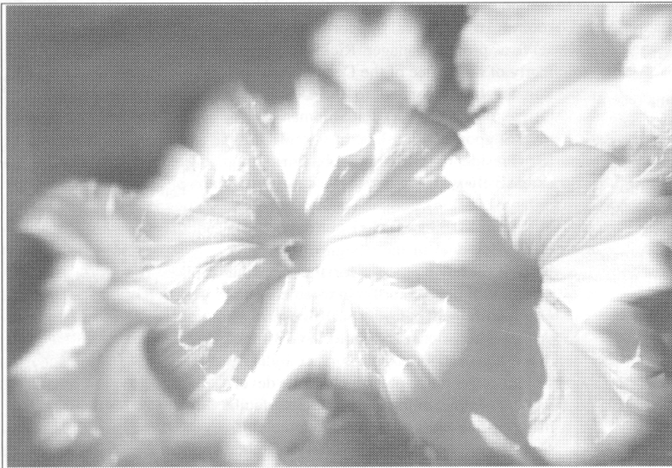
The flowers on the University's front lawn blossomed beautifully this summer, thanks to sunny skies and the vigilant care of Physical Plant workers.