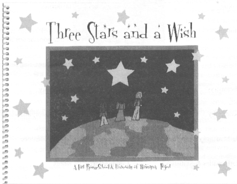
Three Stars and a Wish: A Fort Rouge School and U of W project.