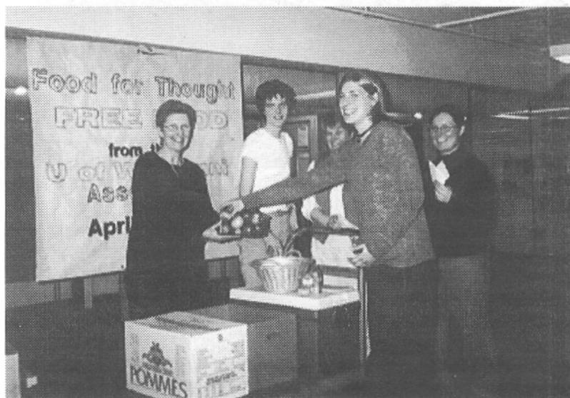
The University of Winnipeg Alumni Association supplied students with apples, cookies, and juice during exams. 'Food For Thought' gave everyone the energy needed to make it through those finals!

The interviewees are between the ages of 18 and 25, and are from middle-class families. High expectations of children is a common thread among parents and often leads to conflict. "The desire to improve their children's future economic situation drives many parents to place high expectations on their children. Meanwhile children are torn between their desire for approval from their parents and their need to be accepted by larger society. Young people find themselves denying their ethnic background in order to fit in at school," she says.