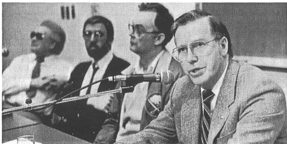
A Mayoralty Candidates Debate was held Thursday, October 16 in 3C00.