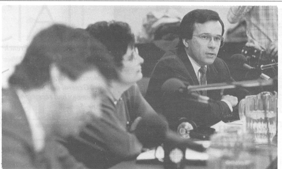
Conservative Gary Filmon, Liberal Sharon Carstairs and NDP Gary Doer addressed provincial election issues at a CBC Radio Leaders' Debate broadcast from The University of Winnipeg on Apr. 22. Manitobans headed to the polls on Apr. 26 to elect a new minority Conservative government.