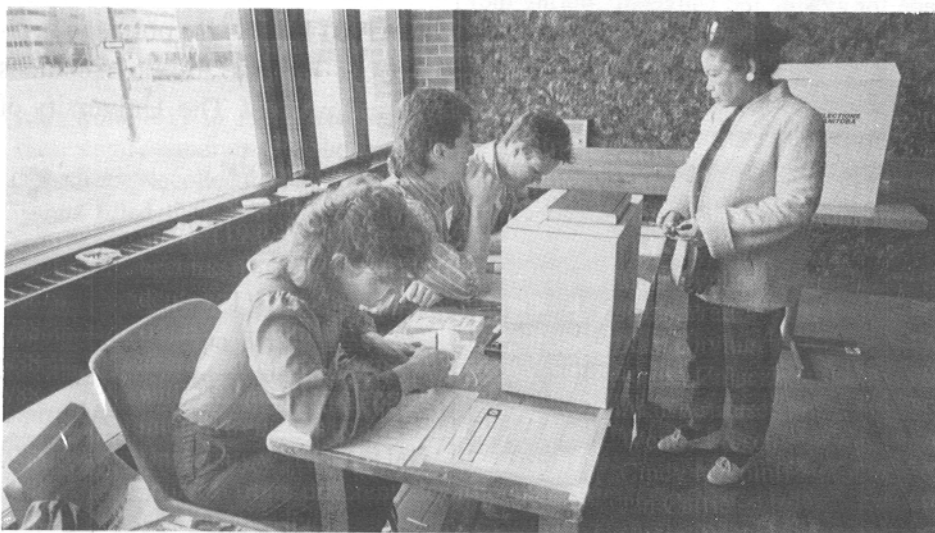
A Wolseley constituency polling station was set up in Lockhart Hall.

A list of the provisions of the Early Retirement Plan may be obtained by contacting the Employee Relations Office at 786-9280.