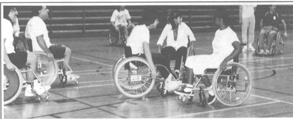
The Community Access Program hosted a sports day, Jan. 26, for inner-city groups. These participants are learning the basics of wheelchair basketball.