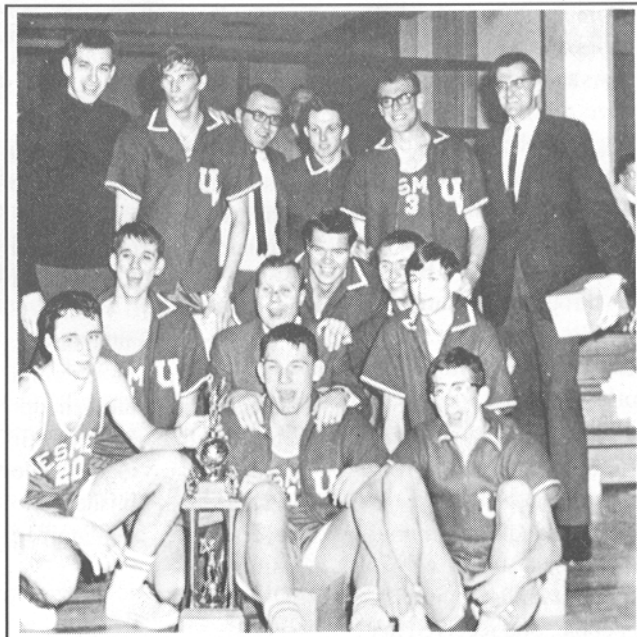
The University of Winnipeg won the first Wesmen Classic 25 years ago.